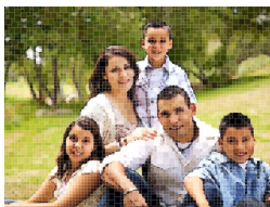
About the Match